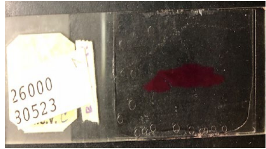
Two small coverslips